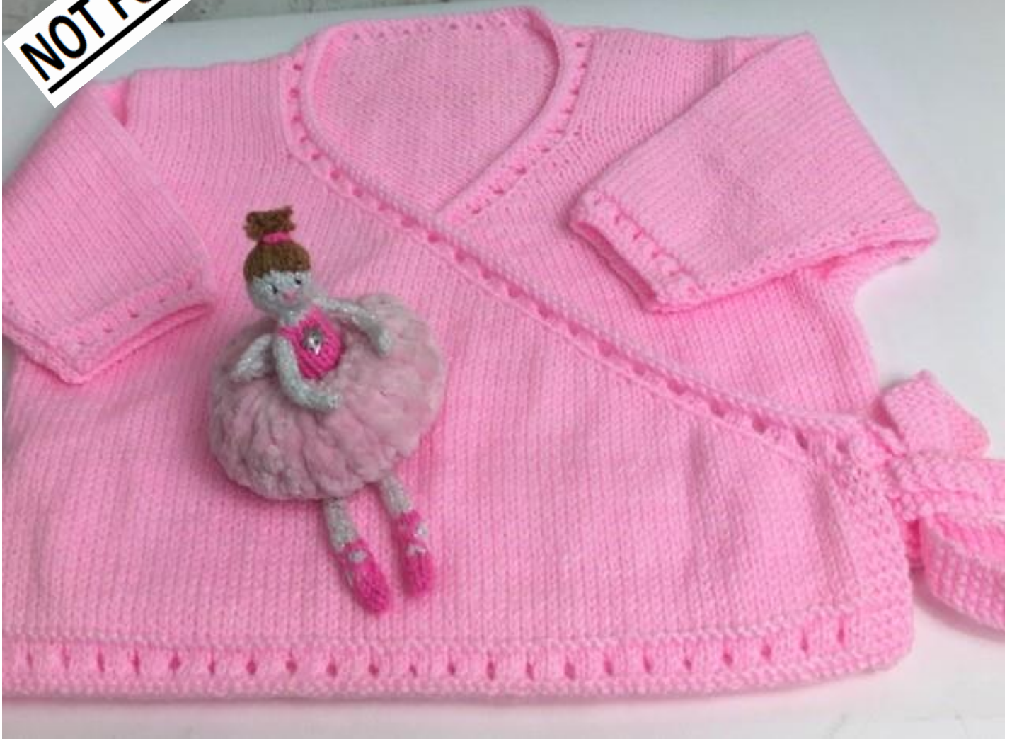
CY14215 Kiddies Supersoft DK Dance Wrap